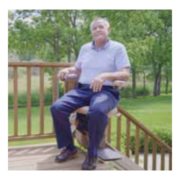
Offset swivel seat makes getting on/off easy.

Footrest/carriage safety sensors stop the unit when obstruction encountered.