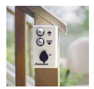
Two wireless call/send controls.