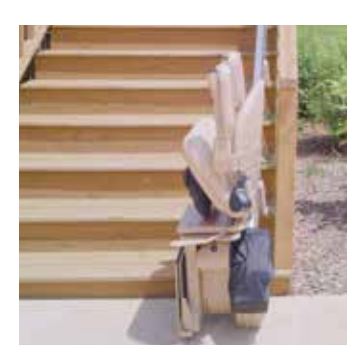
Flip up arms, seat and footrest create plenty of extra space on steps.