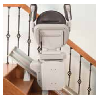
Power folding footrest automatically flips up/ down when seat is raised/ lowered.