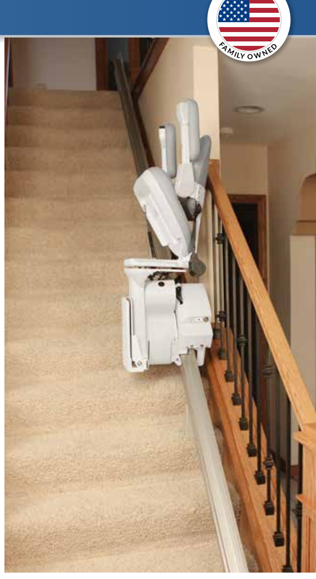
Compact design for open space on stairs.