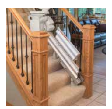
Power or manual folding rails for narrow hallway or when doorway is at the bottom of stairs.