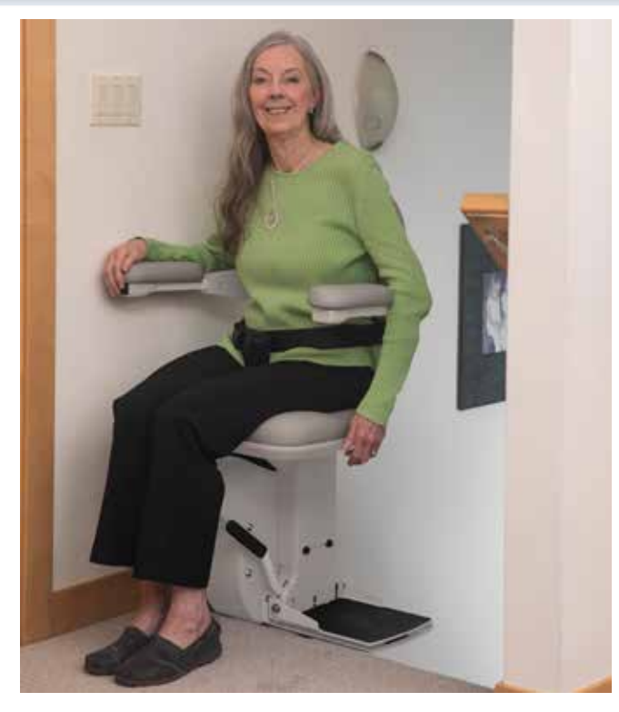
Offset swivel seat makes it easy to get on/off.

\star \star \star \star \star \checkmark \checkmark Verified order